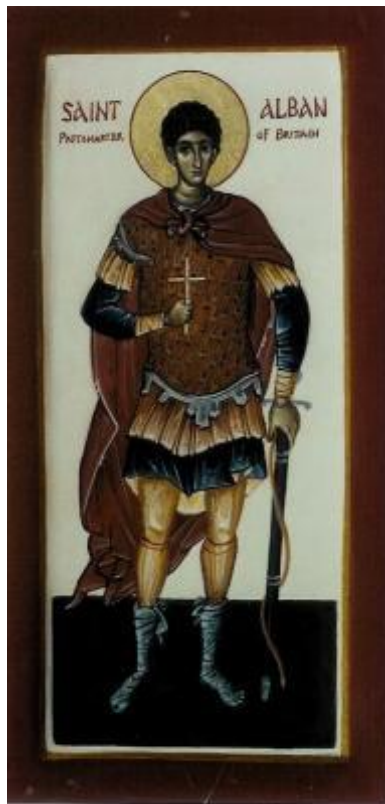
St. Alban the Protomartyr of Britain

O heathen worshipers of false deities, who in your madness venerate the elemental forces of nature as divine, ye are confounded and put to shame by the courageous witness of Alban most wise, who, brought before the pitiless tyrant, steadfastly refused to offer sacrifice to inanimate things, bravely proclaiming with the Psalmist that the gods of the pagans are demons. Wherefore, having witnessed to Christ on earth, he hath inherited His kingdom in the heavens.