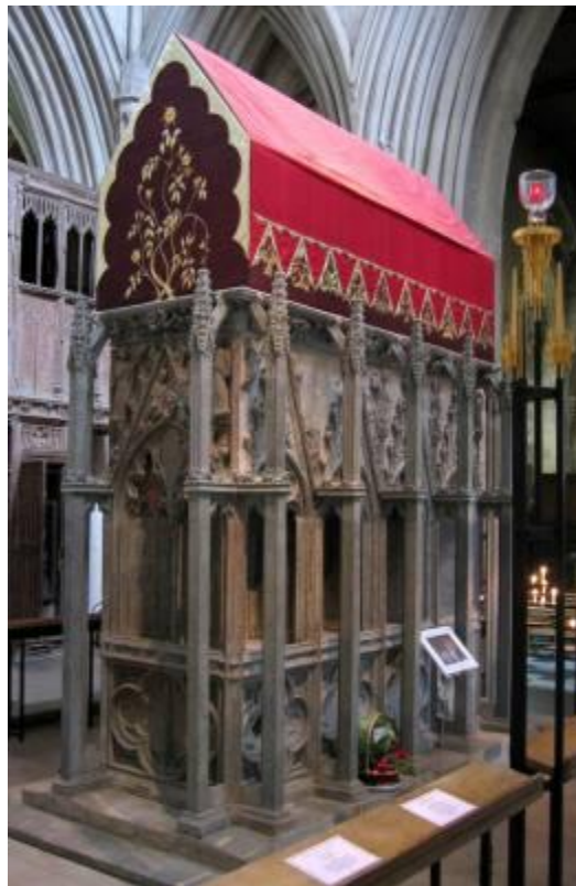
Shrine of St. Alban in his cathedral (St. Albans, England)

http://en.wikipedia.org/wiki/Saint_Alban